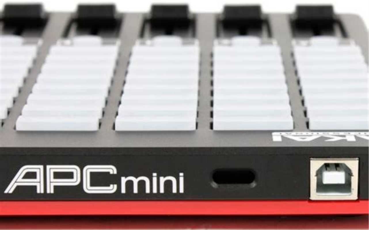
Akai professional apc mini performance controller voor ableton. Akai pro apc mini ableton performance controller.